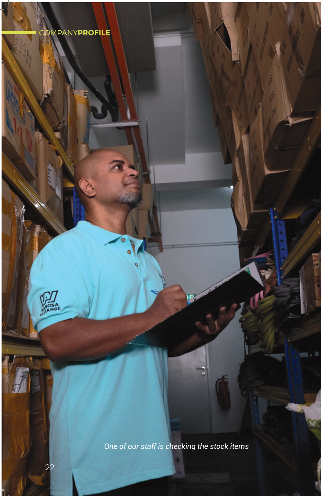
One of our staff is checking the stock items